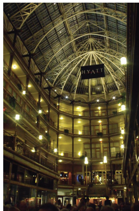
The Hyatt Arcade