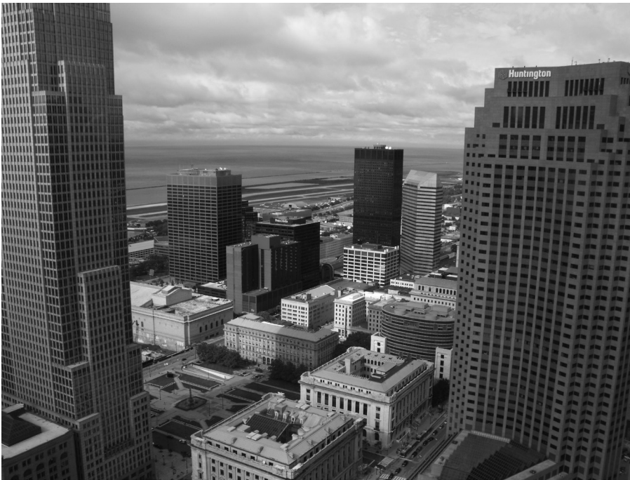
Cleveland and Lake Erie