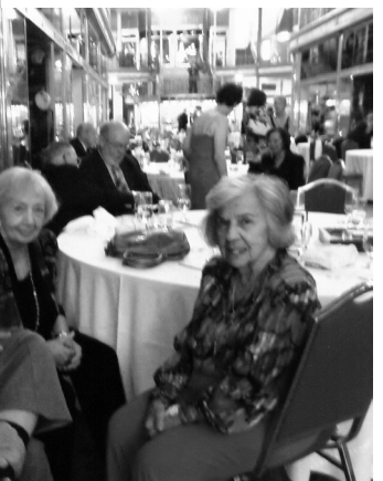
At the Banquet