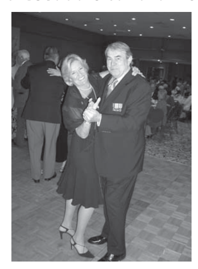
Dancers Have the Most Fun

The following were paid attendees at the 2005 Reunion in Las Vegas. Altogether there were 119.