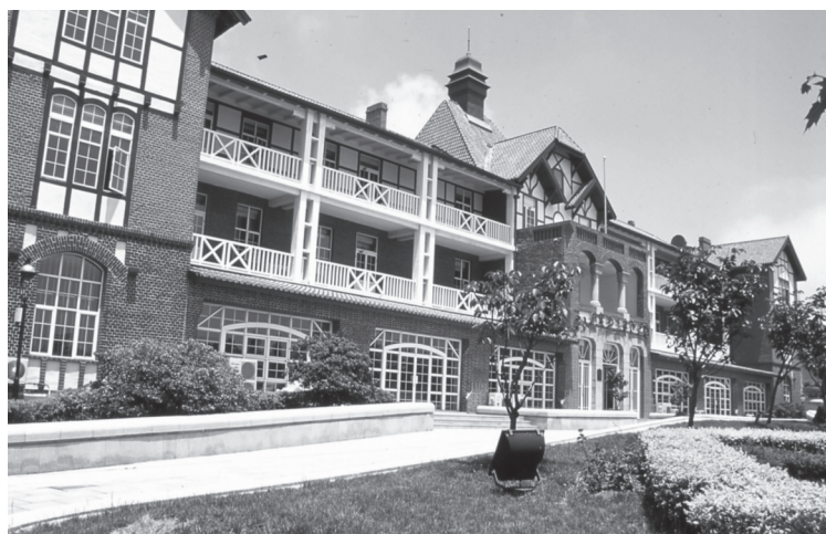
The Grand Hotel—It's a little spiffier now than when it was home to the 29 th Marines during much of their China stay.

I had, with my photos, the certificate of the surrender with my name on it. They refused to believe it.