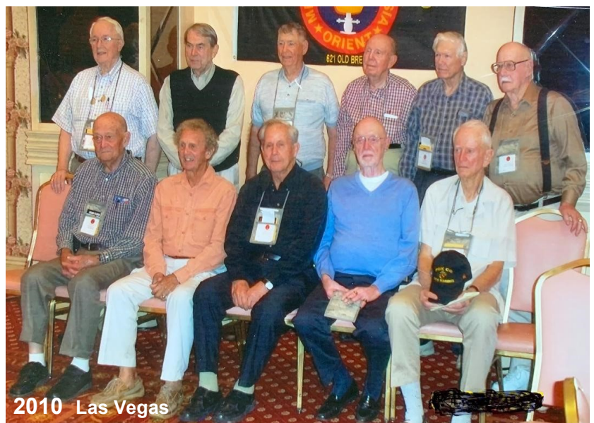
2010 Las Vegas