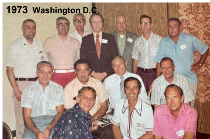
1973 Washington D.C.