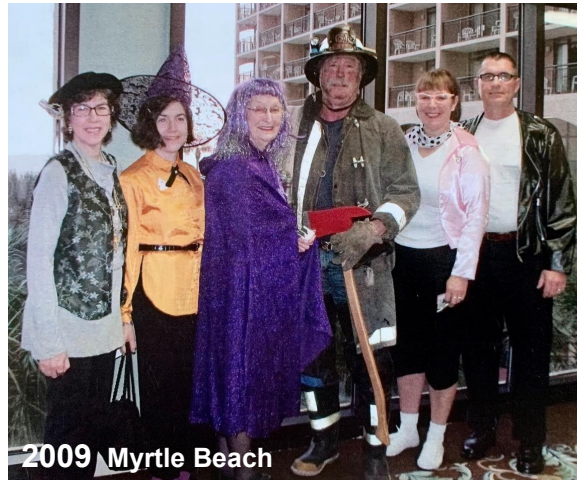
2009 Myrtle Beach