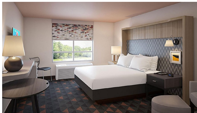
king room at the Holiday Inn Fredericksburg Conference Center