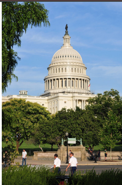
above: Washington D.C. top right: Williamsburg, VA bottom right: Yorktown, VA

See pages 6-10 for more reunion information